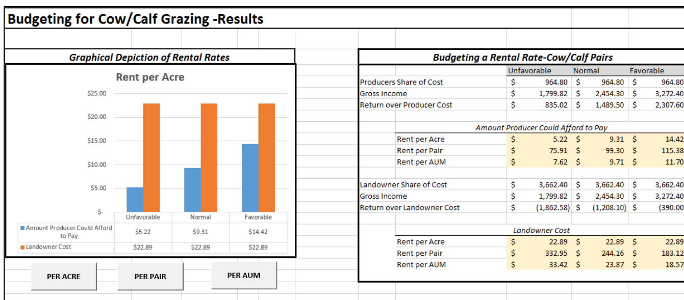
Figure 9: Calculated Rental Rates for Default Cow/Calf Budget

on a per-pair or per AUM basis, since costs are spread over more animals. Again, because of the rent/value ratio on land or producer expectations to cover all cow costs, Landowner Cost can exceed the Amount Producer Could Afford to Pay and someone will have to be willing to accept a lower return. In this example even in a favorable year the producer will be able to match the landowner’s expected return. The rent-to-value ratio will need to be adjusted down or cattle producer will have to reduce yearly cow costs to only covering variable costs.