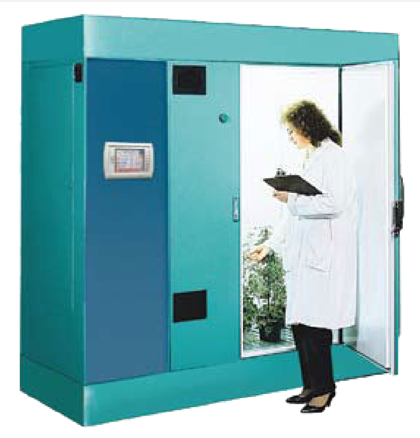
Plant Growth Chamber