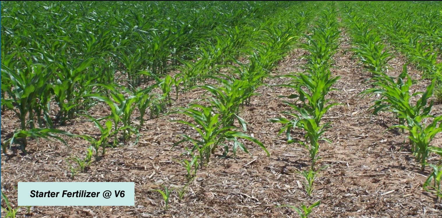
Starter Fertilizer @ V6

Summary: The rapid adoption of new methods and technologies that preserve profitability is important for the economic sustainability of farmers in the High Plains. The work and investigation summarized in this article will demonstrate the use of spatial and temporal observations to identify best management practices for multiple nitrogen (N) applications through corn development.